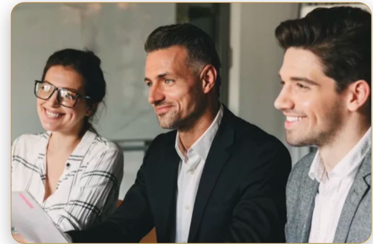
Social Media Marketing