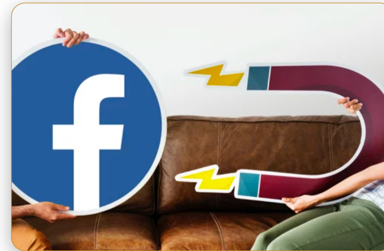
Lead Magnet Design