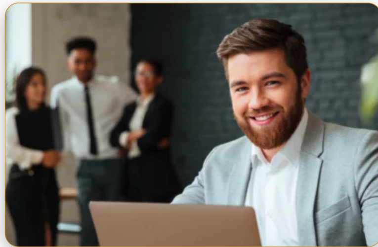
Digital Marketing Training & Consulting